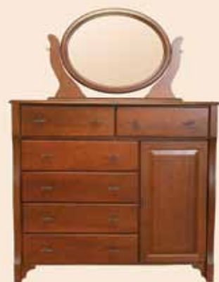
W652T2D Mule chest with six drawers and one adjustable shelf behind raised panel door. w: 52" d: 19" h: 45 3/4"