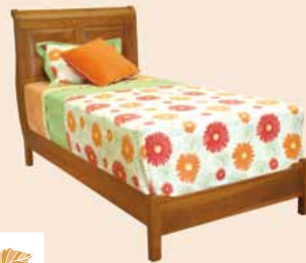
Wellington Solid Panel Sleigh Bed with low profile footboard option.