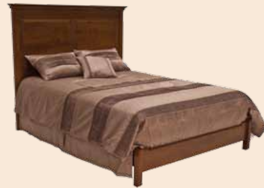
Wellington Panel Bed with low profile footboard option.