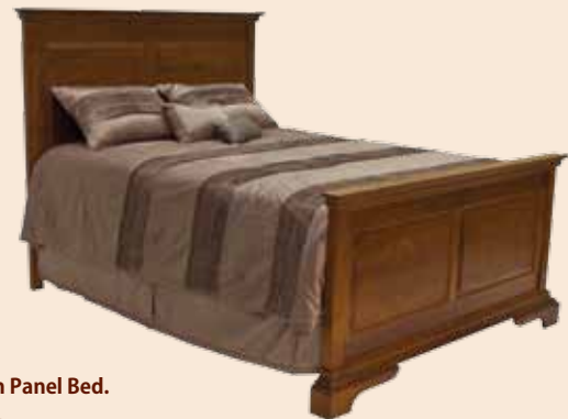
Wellington Panel Bed.

*twin and full accommodate under bed storage options